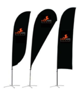
Flags Premium printed graphics and 100% aluminum alloy & fiberglass pole. Come in 8', 10' and 12' sizes and multiple shape options. Weighted cross base or ground stake available.

Instagram Sign Printed on our coroplast sheet material and die-cut to form a frame that is #perfect for sharing on social media.