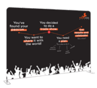
Quick Click Backdrop Slimmer, streamlined look. Single or double sided pillowcase print that fits over a interlocking tube frame. Comes in Curved or Flat and multiple sizes.